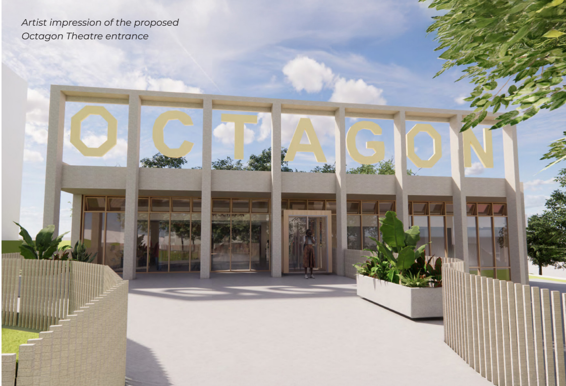
Artist impression of the proposed Octagon Theatre entrance

The development of the Octagon Theatre will provide an economic boost for Yeovil and the surrounding area. Creating jobs and supporting the local economy and town centre. Whilst the economic basis for development is compelling, this project is also about improving the health and wellbeing of everyone living within our county and beyond.