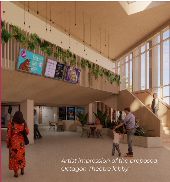
Artist impression of the proposed Octagon Theatre lobby

2028/29 - Construction work is completed and the building is decorated and furniture and equipment installed. There is a period of commissioning, snagging and training as staff move back into the Octagon Theatre and reopen the theatre.