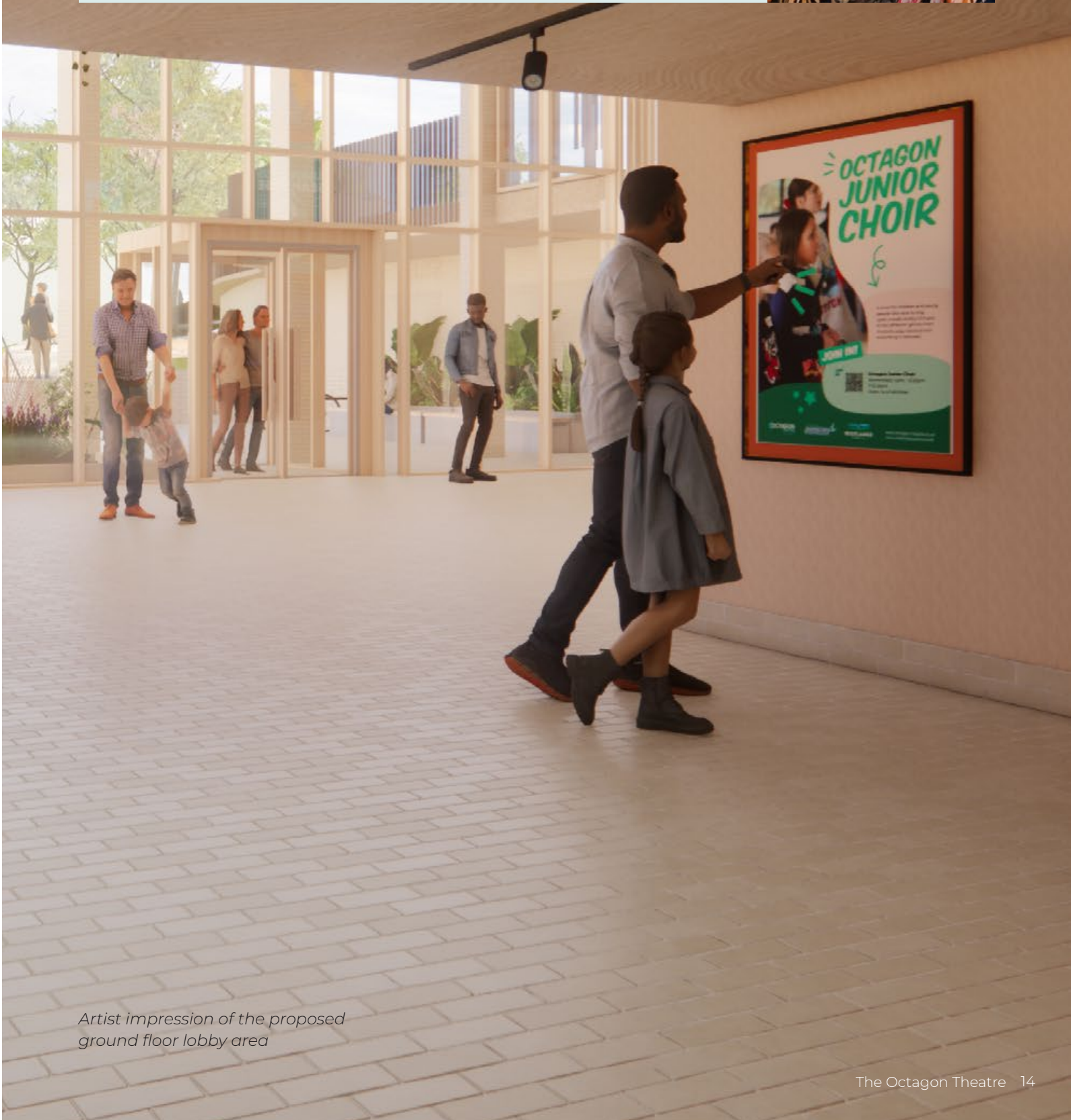
Artist impression of the proposed ground floor lobby area