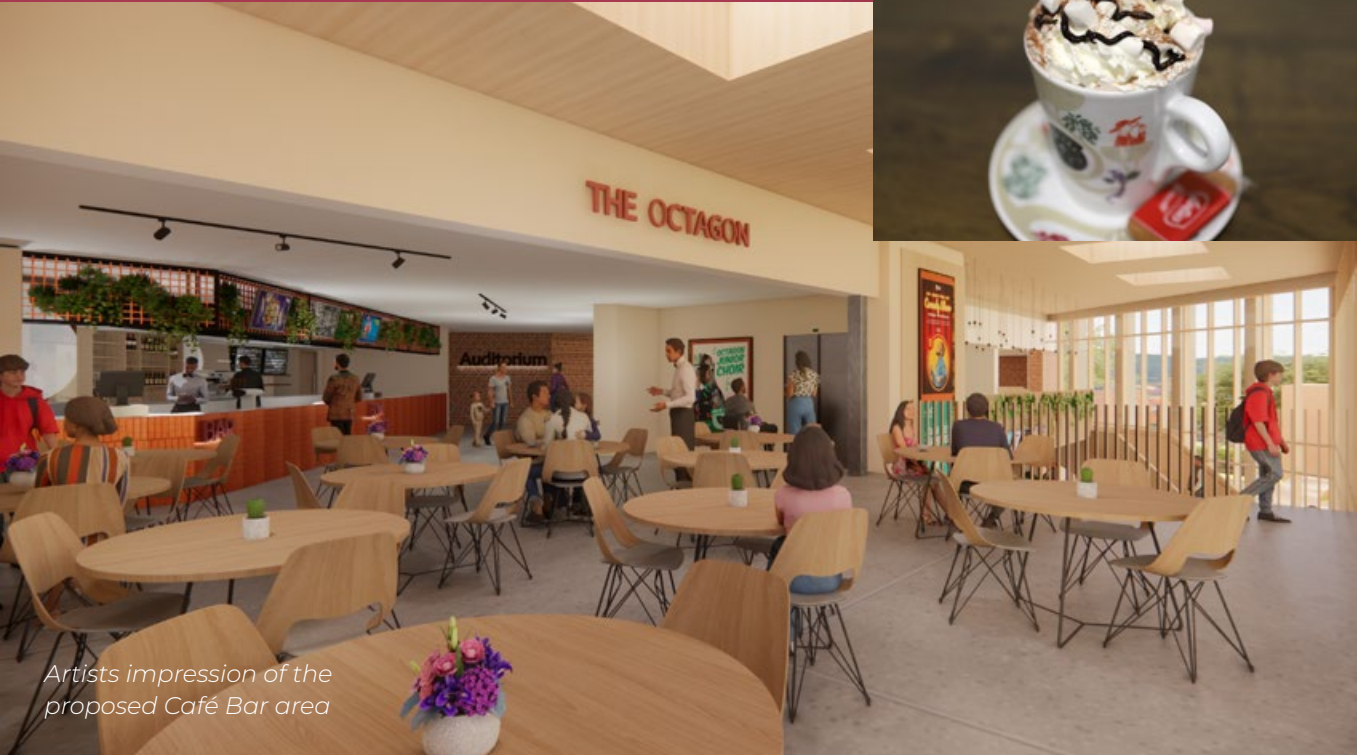
Artists impression of the proposed Café Bar area