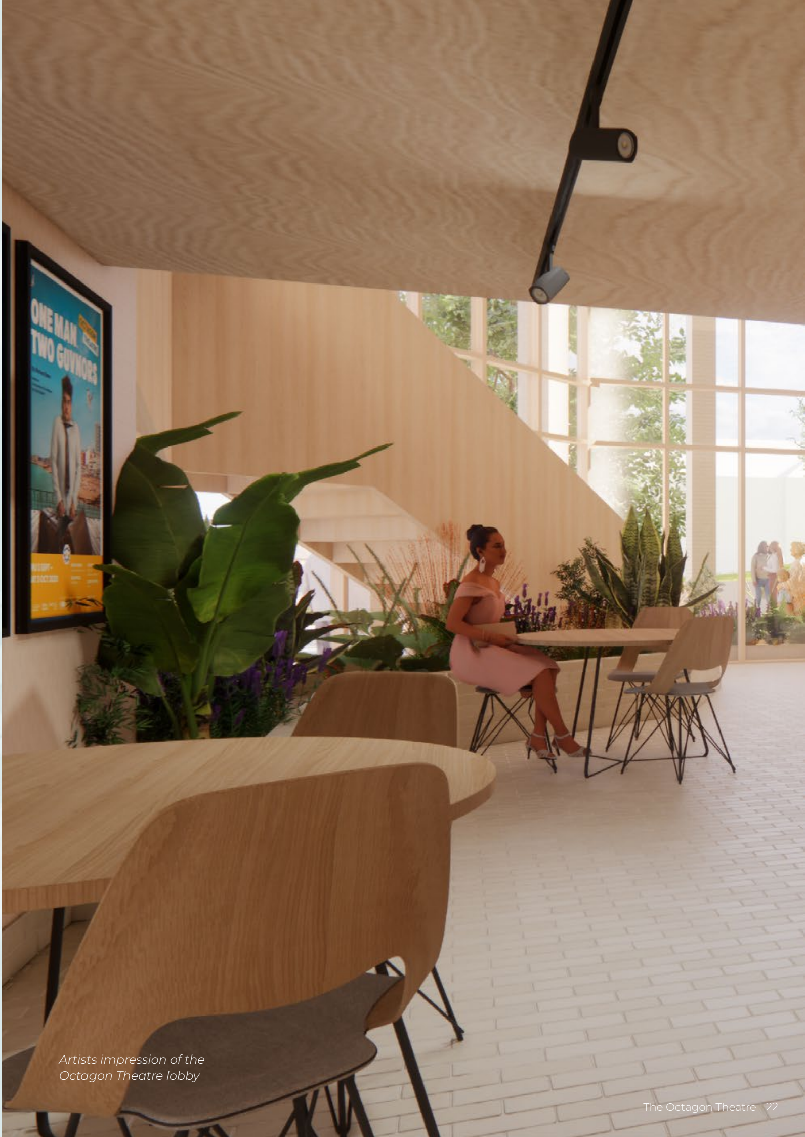
Artists impression of the Octagon Theatre lobby

Construction work is completed and the building is decorated, with furniture and equipment installed. There is a period of commissioning, snagging and training as staff move back into the theatre, which is currently anticipated to reopen in winter.