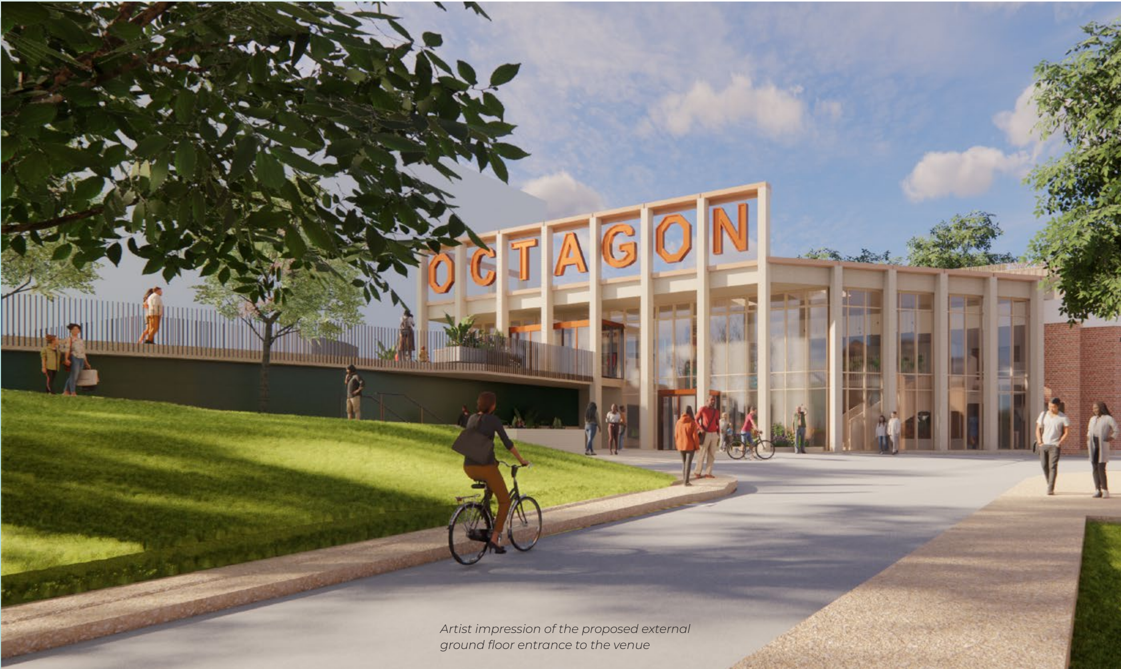
Artist impression of the proposed external ground floor entrance to the venue