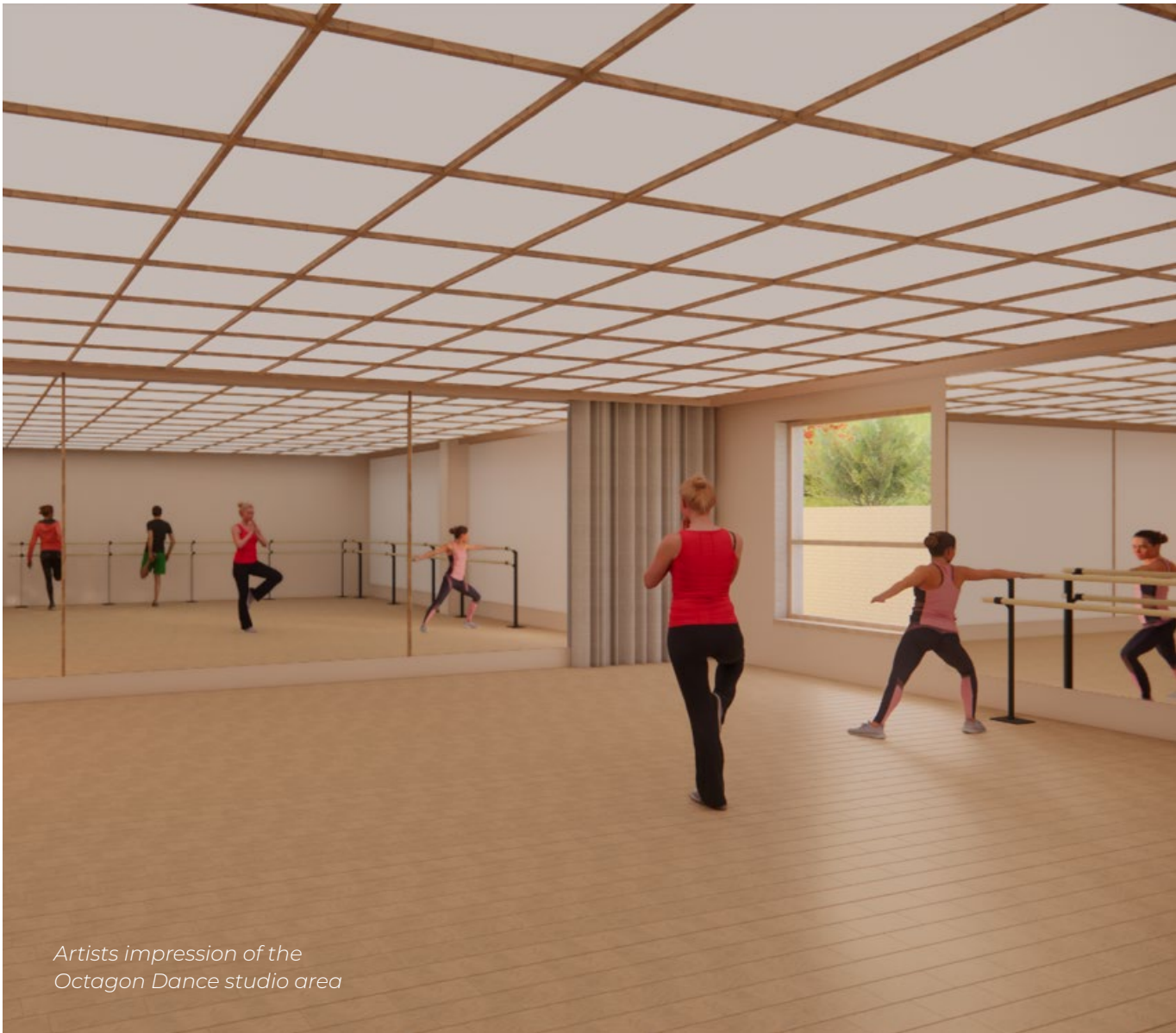
Artists impression of the Octagon Dance studio area

The Studio also offers an alternative space for additional classes and rehearsals including our popular choir, theatre groups and arts and craft workshops. Our participatory programme brings communities together in forging new friendships and improving the health and wellbeing of local residents. They are also key to our engagement programme where workshops can be delivered by the companies performing in the main auditorium.