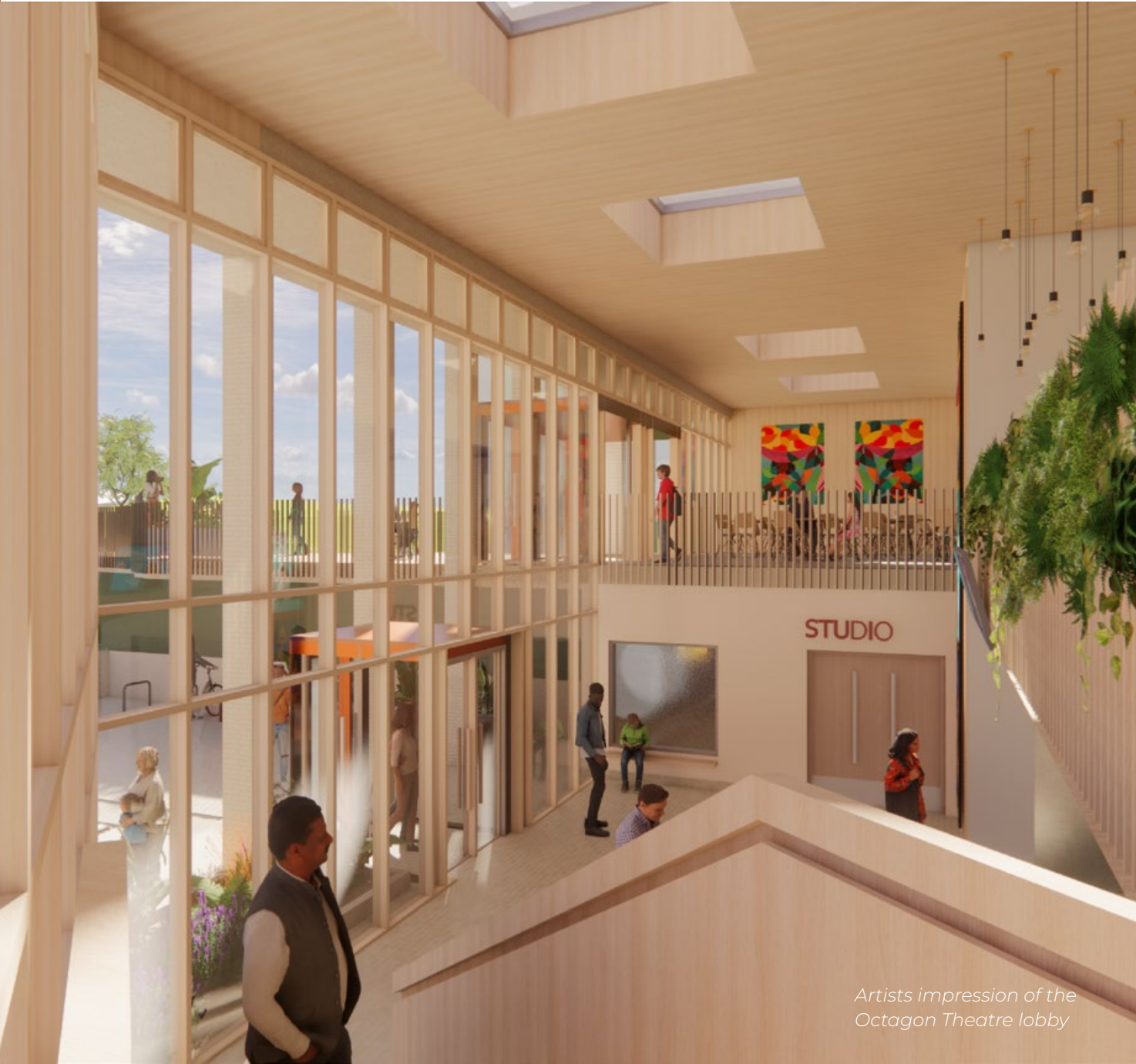
Artists impression of the Octagon Theatre lobby