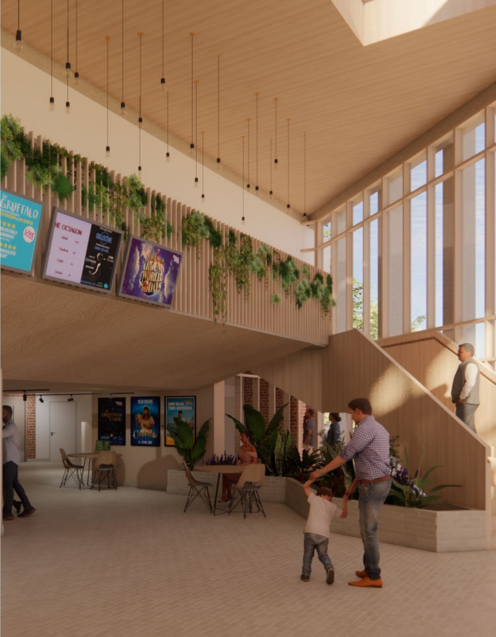
Artists impression of the Octagon Theatre lobby area

Credit and our thanks to Len Copland who has supplied many of the photos taken in this document.