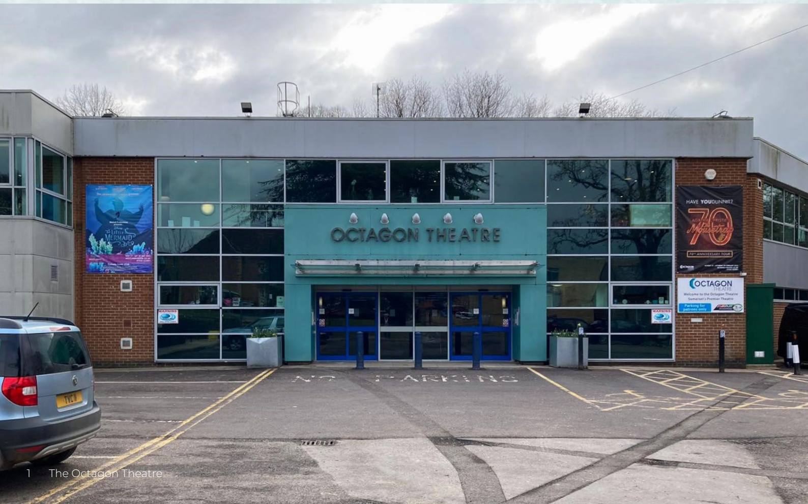
Images from our history - The Octagon Theatre opened as The Johnson Hall in 1974.

authority. Yeovil Town Council arranged a public meeting on the future of the theatre with members voting to support the development of the Octagon Theatre. Working in partnership with Somerset Council, Yeovil Town Council voted to offer, in principle, capital funding to the development of the Octagon Theatre to secure the venues future for the town and to seek to keep the £10m of government funding for the development. We are pleased to share with you our plans, vision and ambitions for this exciting development that will help to secure the future of the Octagon Theatre for generations to come.